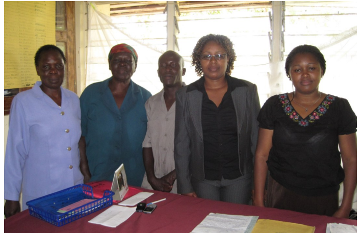
Caregivers in Kendu Bay with their District Officer

ICASA began in 1986 largely as a scientific conference, and has grown into an agenda-setting venue where representatives of various advocacy agencies and populations - most notably people living with HIV - come together to exchange practices, hear about policy developments and, ideally, influence priorities of policy makers, scientists and the private sector. Yet, despite the disproportionate effect on poor women, grassroots women's representation at ICASA has consistently been low, stressing the need for continued investment in bringing community perspectives on effective, accountable AIDS responses into international policy spaces.