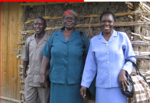
Caregivers in Kendu Bay celebrate a new office building