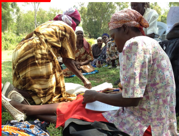
Grandmother's savings group from Kendu Bay, Kenya